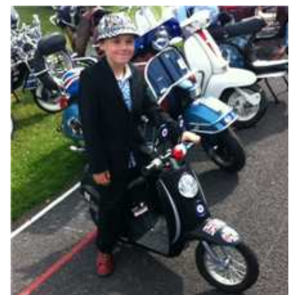
Mods look so young