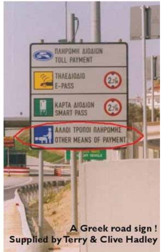
A Greek road sign !

More details to follow or ring Phil on 01254 245956